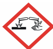
Corrosive to metals